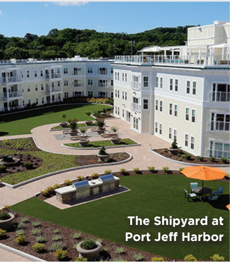
The Shipyard at Port Jeff Harbor