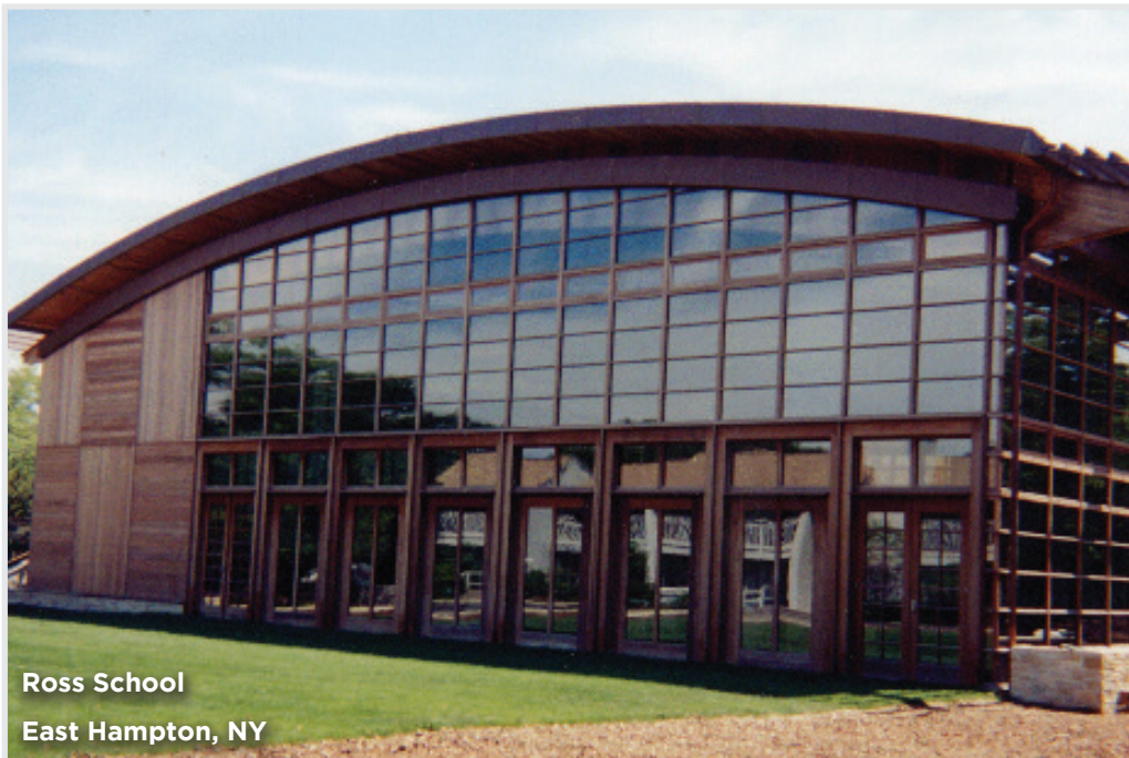
Ross School East Hampton, NY