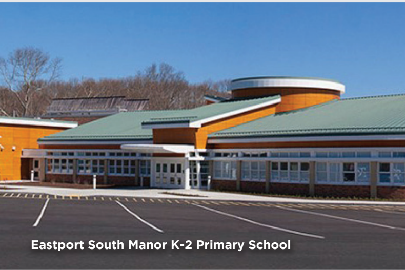
Eastport South Manor K-2 Primary School