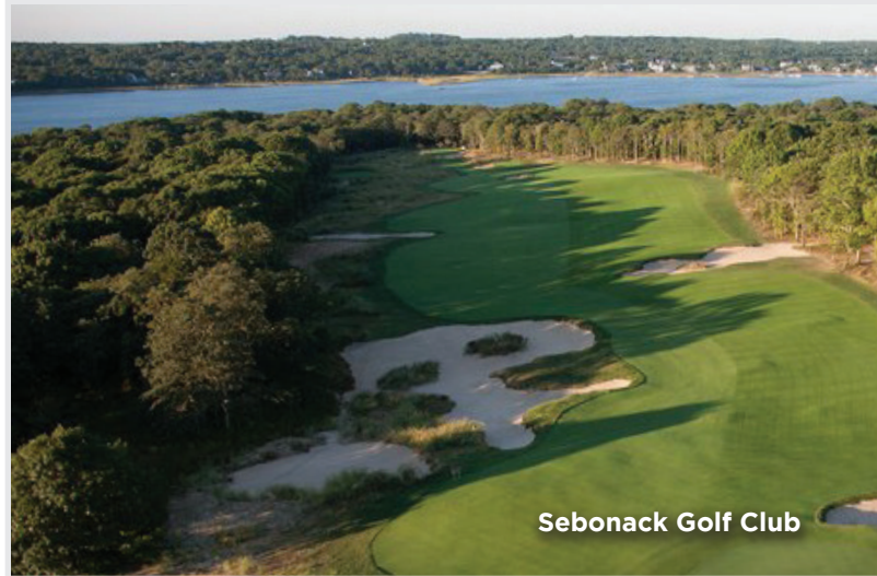
Sebonack Golf Club